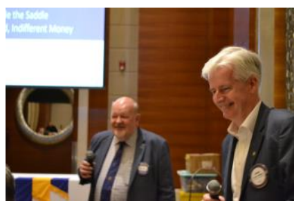
Very Happy Money