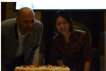
Happy Birthday Stars